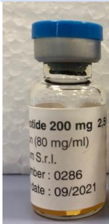
Sample from Latvia