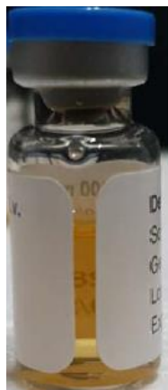
Sample from Latvia