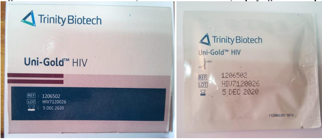
Figure 2 - Falsified Uni-Gold ^{\text{TM}} HIV, displaying labelling inconsistencies

Figure 1 – Falsified Uni-Gold™ HIV, lot number HIV7120026, displaying falsified expiry date